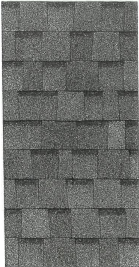
Not available in Service Areas 2, 6.