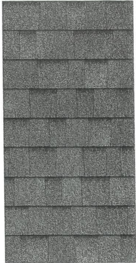
Not available in Service Areas 2, 6.